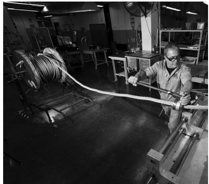
Wire rope winding done at our Puerto Rico manufacturing plant.